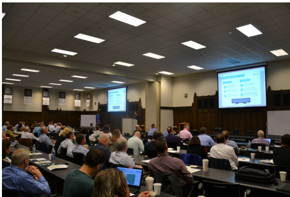
Pictured: Over 80 seminar attendees.