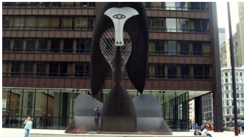
Pictured: Front of the Daley Center