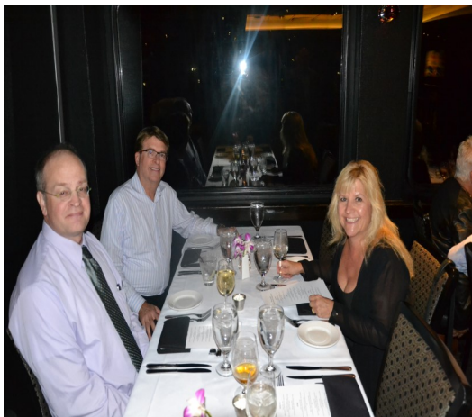
Members enjoying cocktails before dinner is served.

October 6, 2016— For the first time ever, CCAI hosted a Lake Michigan Boat Cruise at Navy Pier where members and their spouses enjoyed dinner and cocktails with views of the Chicago skyline. It was the perfect atmosphere to meet with new members and reconnect with old friends.