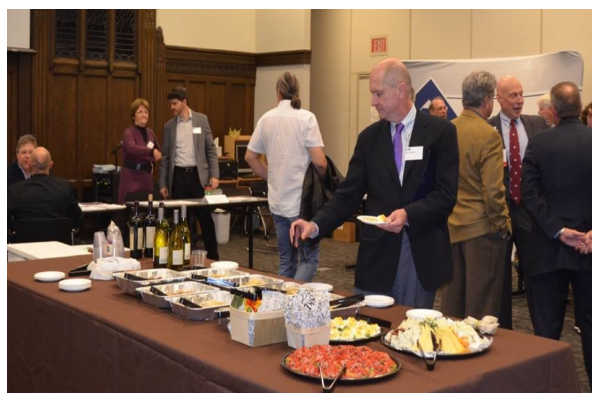
An attendee enjoying the delicious hors doeuvres at our snack and beverage table.