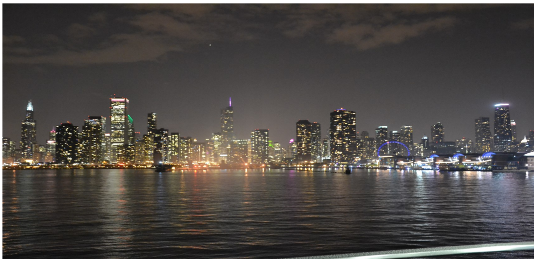
View of the Chicago skyline from the cruise deck.