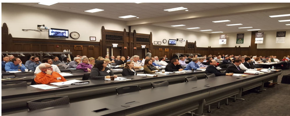
The property tax seminar had a great turnout of over 100 lawyers and appraisers.