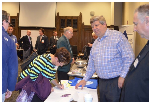
Student filling out application at one of the many job booths.

ICAP hosted their first job fair at the Chicago Education Center where employers like Allstate Appraisal, Rowe Appraisal Group, The Private Bank, Accurity United, PF Appraisals, CBRE, Appraisal Research Counselors, Value Net/ Accurate Group, JSO Valuation, Advanced Appraisal Associates Inc., and Argianas & Associates, were able to meet and network with nearly 100 prospective employees. “Great event! Thanks to ICAP for the idea and funds to implement. Thanks to those who made arrangements and created the environment,” stated one attendee.