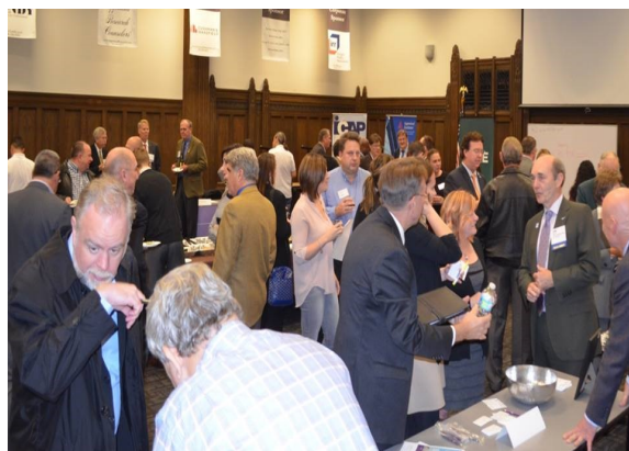
ICAP had a great turnout for their first job fair with nearly 100 employers and employees.